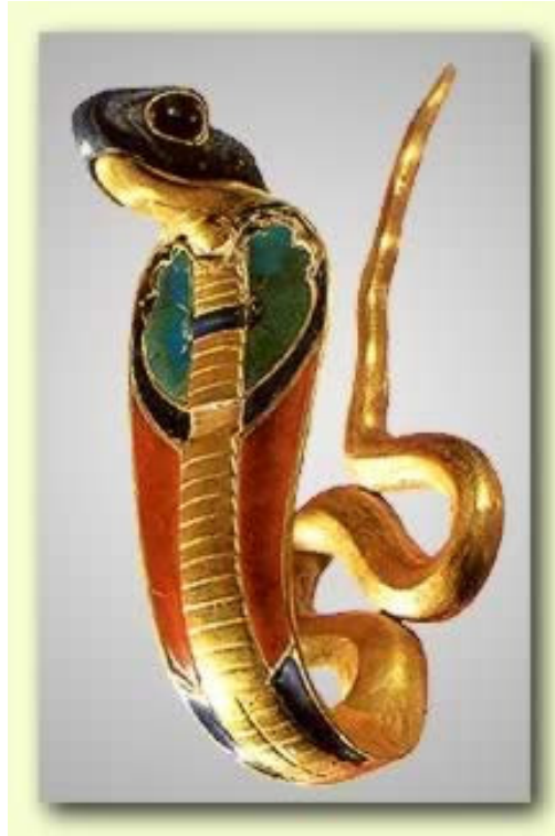
Joseph's Serpent? / discovered at the ruins of Senusret II 's pyramid.

And the serpent said unto the woman: 'Ye shall not surely die; for God doth know that in the day ye eat thereof, then your eyes shall be opened, and ye shall be as God, knowing good and evil.' (“Genesis” 3- -4-5)