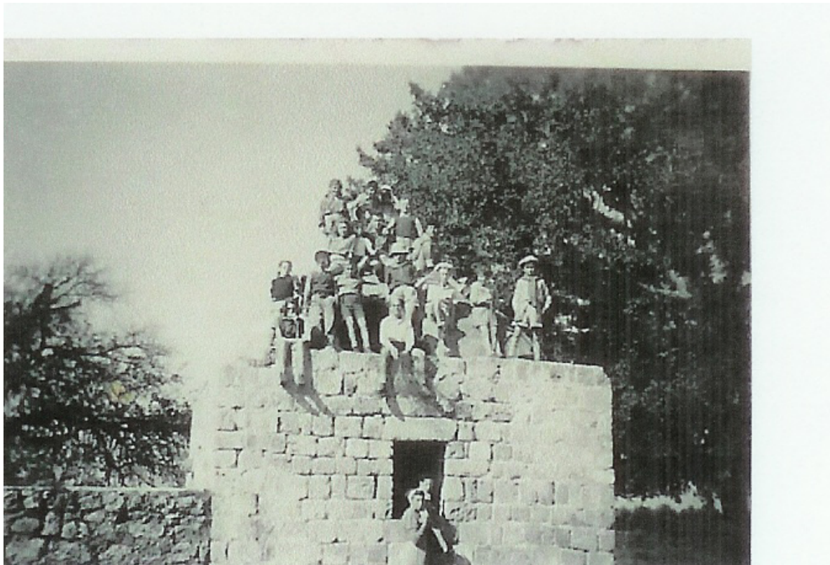
Sycamore-trees Spring 1946

“Point in Time” of = (“Isaiah” 66- -22) = “ A New Creation ” will come. So we can wish that “ His Spirit ” shall break the “ Capstone ” into pieces and use it as “ A Touchstone ” on His “ Judgment Day ” with the intention to give back the “ Covenant Tablets ” II to us, for saving “ Our Eternity ” by “ Peace & Truth ” = (“Jeremiah” 33- -6). The “ Voyage of the Israelite Caravan ” as “ Jews and Others ” is continuing together with the streaming water of that ancient canal that was erected by Joseph . Although the ancient pharaohs tried to erase Joseph’s name from existence, still, we find it in Egypt at his 37 th year of his life, and still, no one can erase the name of “ Bahar Yusef ”.